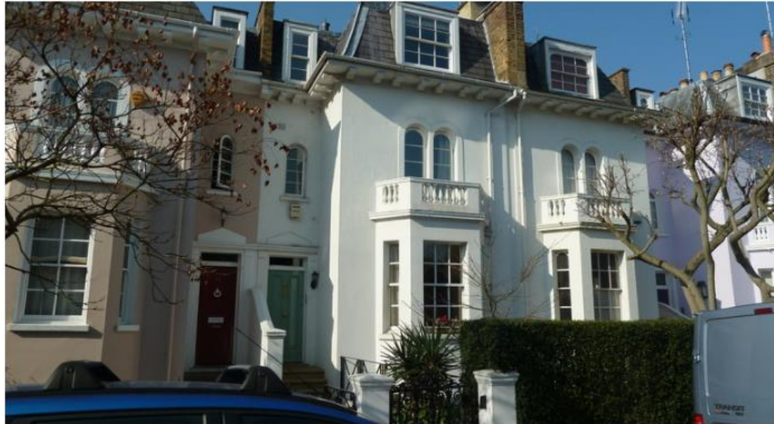
This Regency house is in a very quiet residential road on the border of Notting Hill and Bayswater, close to the designer shops of Westbourne Grove.

Europe and in particular the main cities of London and Paris are a big focus for the club this year and we are actively looking to add more members in these areas. However, currently 3RD HOME has a varied selection of properties in London including a Regency house in Notting Hill, penthouses on Hyde Park and near the river and smaller character apartments in Kensington. London is such a popular destination for our members that demand regularly outstrips supply so we would welcome additional lovely properties.