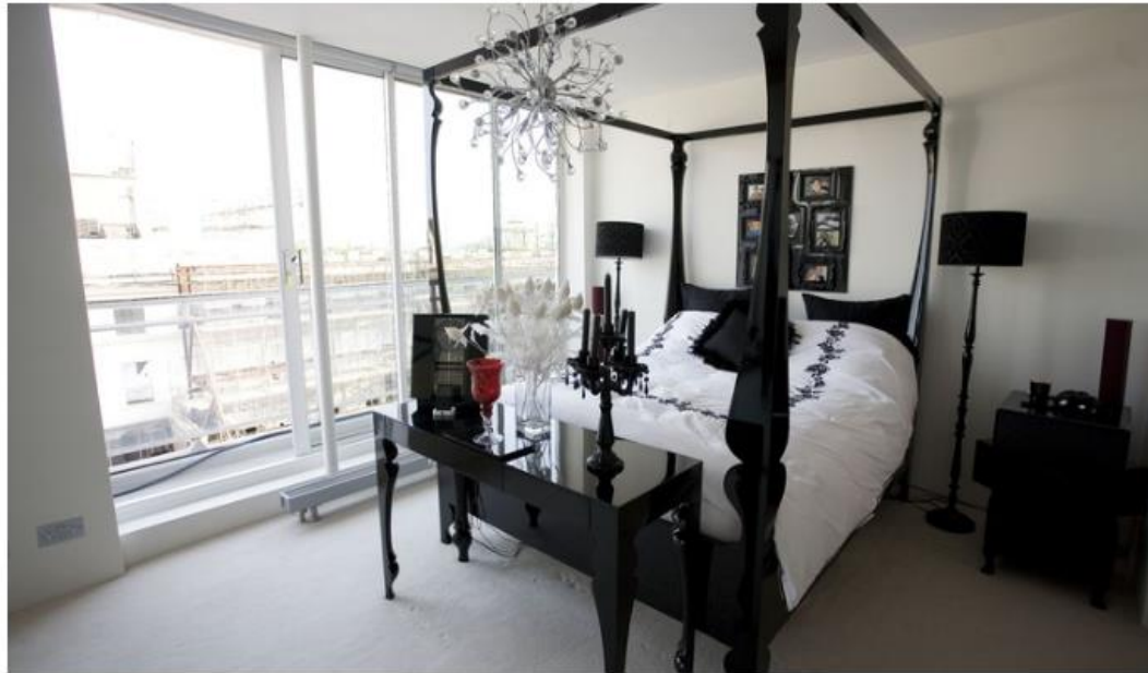
This Hyde Park penthouse is very bright with floor to ceiling windows in every room and some offer extensive views across the cityscape of London.