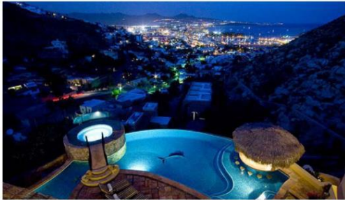
The works: this huge house overlooking the Bay of Cortez in Mexico sleeps 16 people and comes with a wonderful pool and six staff.

Getting away with the gang is growing in popularity with Londoners. Renting a big holiday home with friends and/or family makes financial and practical sense, and villa specialist CV Travel says 40 per cent of its portfolio now involves properties that will accommodate two or more families.