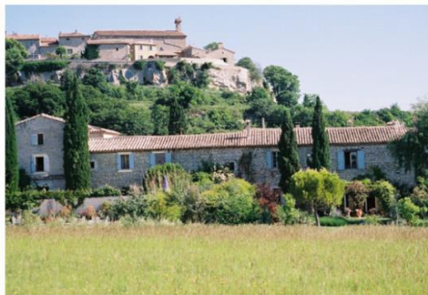
Casa Lazzari: 400-year-old farmhouse, on the Tuscan-Umbrian border. Through Lovehomeswap.com