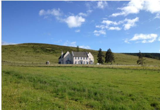
Scottish mansion: rural splendour near Gleneagles.