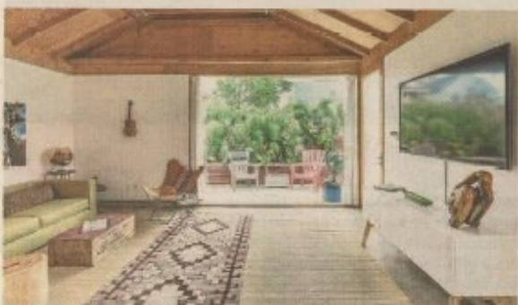
Kubrick House, Santa Monica, Los Angeles, on Onefinestay