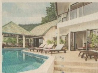
Samui Sunset Pavilions Villa, in Koh Samui, Thailand, on Airbnb