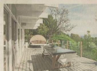
A property in Sunset Crescent, Los Angeles, on Onefinestay

'It's cool to be part of the sharing economy and talk about it at parties'