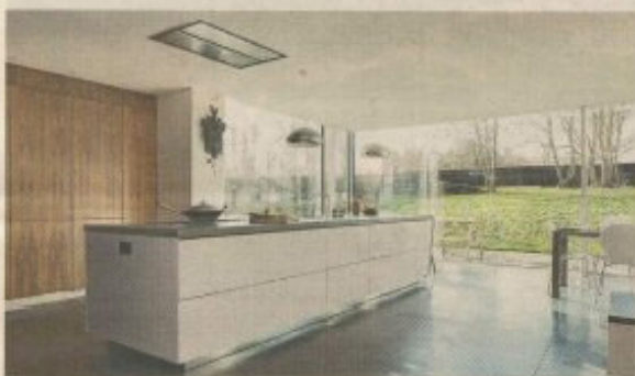
A property in south London, available through Onefinestay