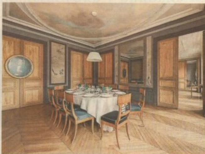
A holiday let in Saint-Germain, Paris, available through Onefinestay