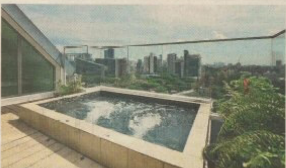
Newton Edge, in Singapore, available through Airbnb