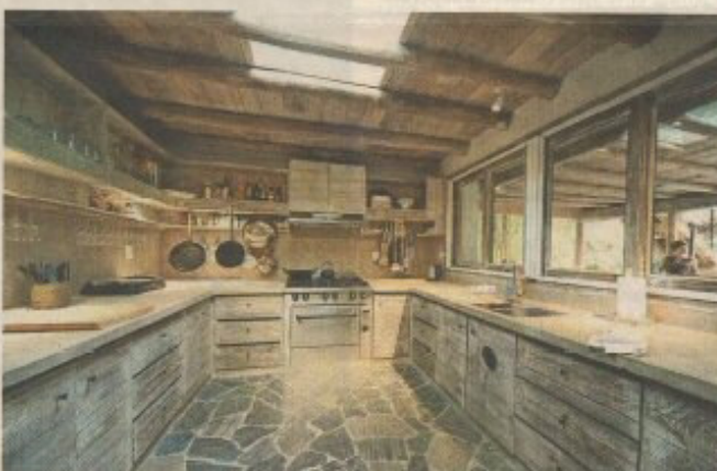
A villa available in Moganshan, near Hangzhou, in China, on Airbnb

night after work and at weekends," she says, adding that global firms should follow her lead to make foreign postings more appealing.