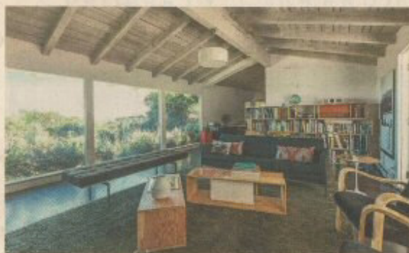
El Medio Place, Pacific Palisades, Los Angeles, on Onefinestay

When tech entrepreneurs Leila Zegna and her husband were planning a move from San Francisco to London last autumn, they compiled a shortlist of six central London neighbourhoods. Rather than gamble with a year-long lease in an area they might not like, they used Onefinestay to find three-week home rentals in each of the six areas. The firm provided a list of suitable homes and arranged each stay; the couple arrived to a welcome from an agent and a mobile phone preloaded with the owner's local tips, from restaurants to dry cleaners. The rental cost was just 15 per cent more than that of a long-term let, reckons Mrs Zegna. "It was a great adventure: we were incredibly mobile, living out of a suitcase and exploring each neighbourhood every